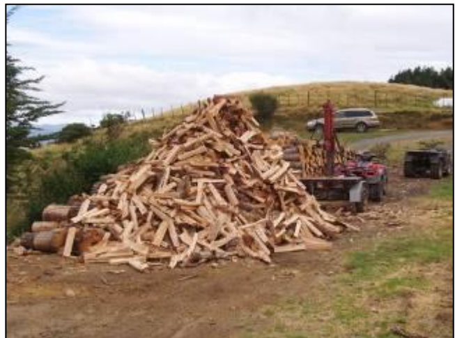
Split wood waiting to be stacked