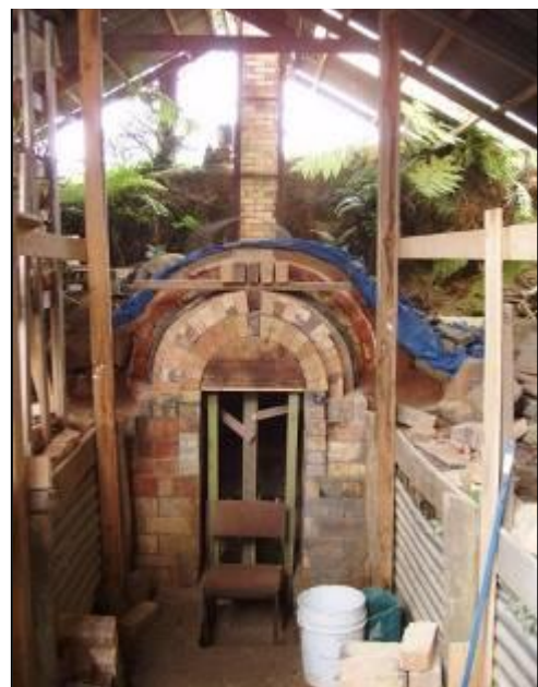
Recipient undergoing repairs