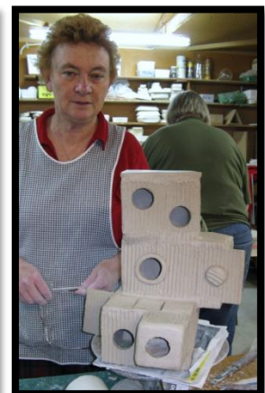
Members of the Otaki Potters’ group building ceramic sculptures during a weekend workshop last year.